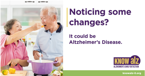
Post: Noticing even slight change in your loved one's personality could signal the start of Alzheimer's Disease. Learn how to spot the signs.