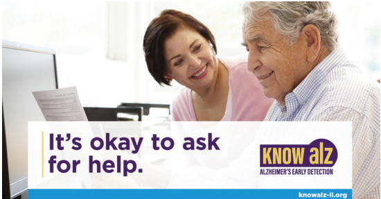
Post: Asking for help means you are strong! We have tips for caregivers who help fight Alzheimer's Disease each day. Learn more.